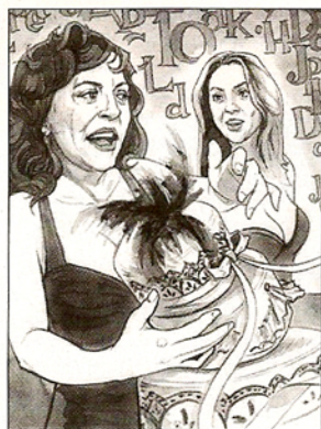
Susan Sarandon saved her daughter’s birthday cake from toppling over with her bare hands.