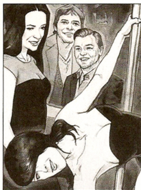
Leo DiCaprio and Ashton Kutcher applauded Demi Moore showing daughter Rumer how to pole-dance.