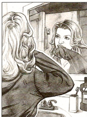
Instead of brushing, Jessica Simpson says she sometimes cleans her teeth with her sweater.